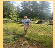
( Before )